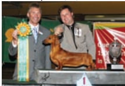
Puppy : Jumarnic Kashn In (SSH)