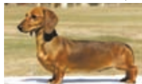
Junior: Daxhaus Angel In Disguise (MSH)