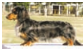
A/B: Ch Graedon Silvery Moon (MLH)