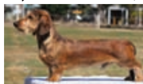
Minor: Dalton Sea Dasher (SWH)