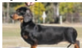
Intermediate: NZ Ch She Rocks of Markwell (MSH)