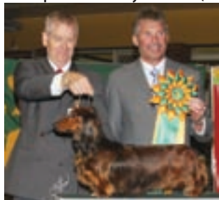
RUBIS: Ch Imlay Duana (SLH)