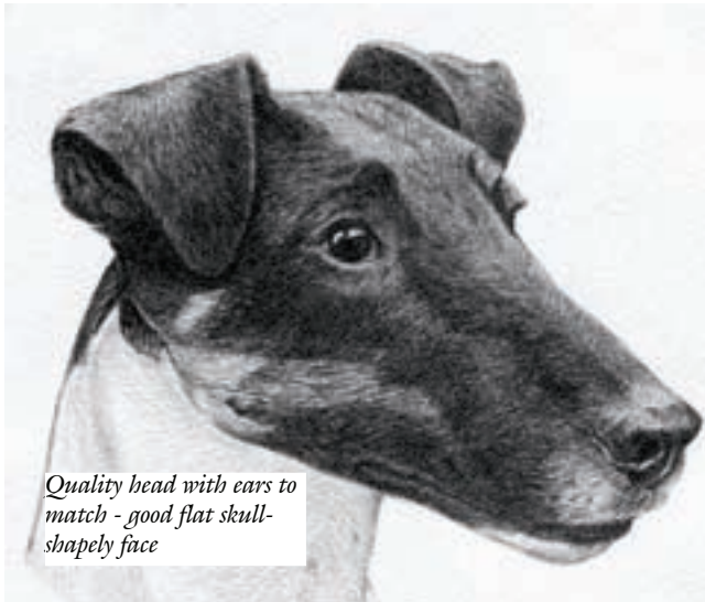
Quality head with ears to match - good flat skull-shapely face

The show dog requires somewhat more trimming and preparation and an excellent routine is set out by Cam Milward in his book, Grenpark Fox Terriers.