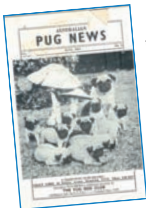
June 1963 Our Cover

This month we are pleased to present a unique photograph of a typical litter of Pug Puppies at the "TENG WAH" Kennels. The baby Puppies shown on the cover are now in the Puppy Class and have been making their presence felt in the show ring. Members of this litter include: