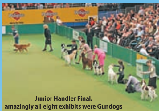
Junior Handler Final, amazingly all eight exhibits were Gundogs

The dog must then return the ball to the start of the course to tag one of its team, who then repeats this process until all the dogs have finished.