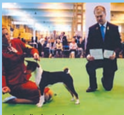
Australian born judge Glenn Dymock's

Information obtained from:- http://en.wikipedia.org/wiki/Crufts http://www.crufts.org.uk/