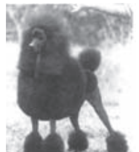
Ch Leander Luck Of The Draw (imp UK)