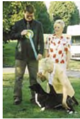
Am Ch Joseter Ardbeg Malt