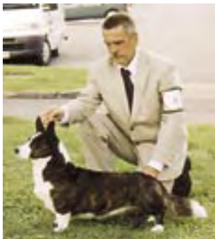
UK /Multi Ch. Blondie's Noble Man