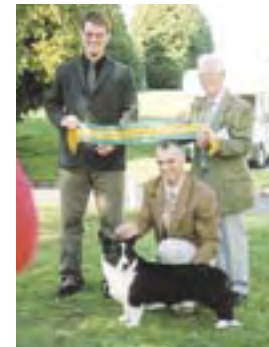
Gowerston Jazz Singer for Pemcader