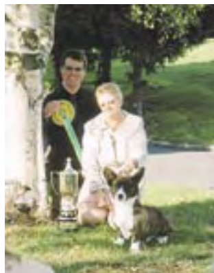
Kerman Strike Up The Band