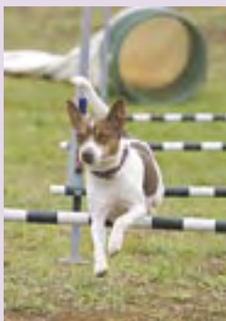
Aust Ch Pintupi My Lord Rex JD