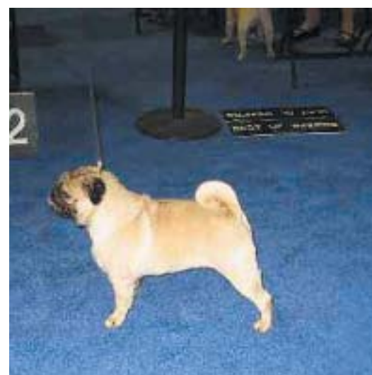
Winners Dog - Mystic Celestial Sky Raider