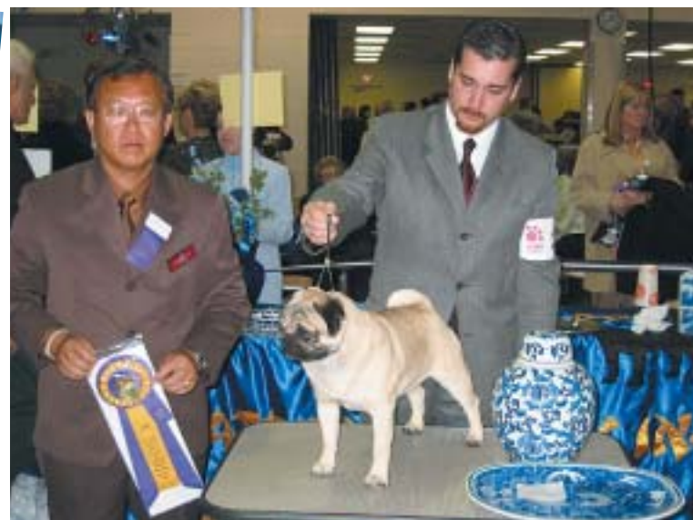
Best of Breed - Ch Alantis' Shiver Me Timbers

I must thank all exhibitors for showing their dogs under me and taking my opinion sportingly. I must admit that I enjoyed my day of judging this show. At the end of the show, I was extremely pleased when handlers, breeders and spectators came up to me and shook my hand.