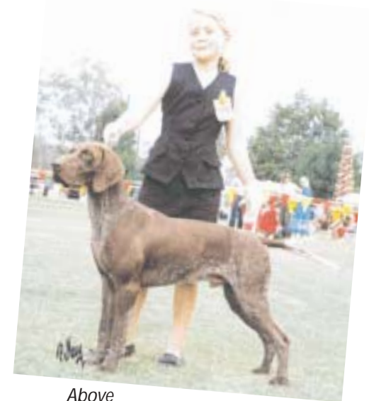
Above Dual Ch Gershoppin Adranet CD, the first Long Tailed GSP to win BOB in Australia