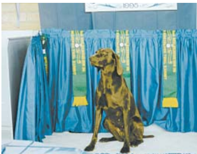
Cheykov Hand Madelace UD four times winner of the Best Exhibit in Trial (Obedience) at the Melbourne Royal