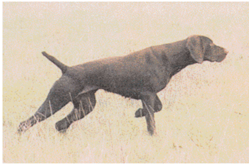
Triple Champion Wauchope FarWalked Woman