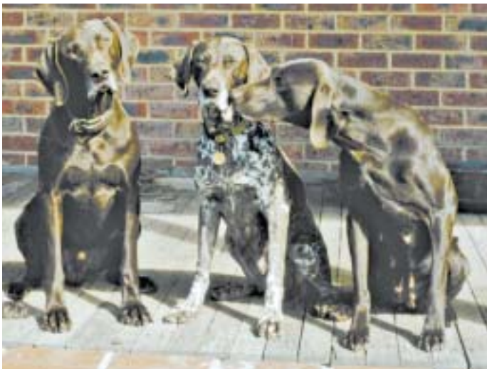
Above left Dual Ch Oakridge Argonaut CDX RRD, and right Dual Ch Oakridge Allesandra ET with their dam, Ch Heiderst Fire N'Ice CDX RRD