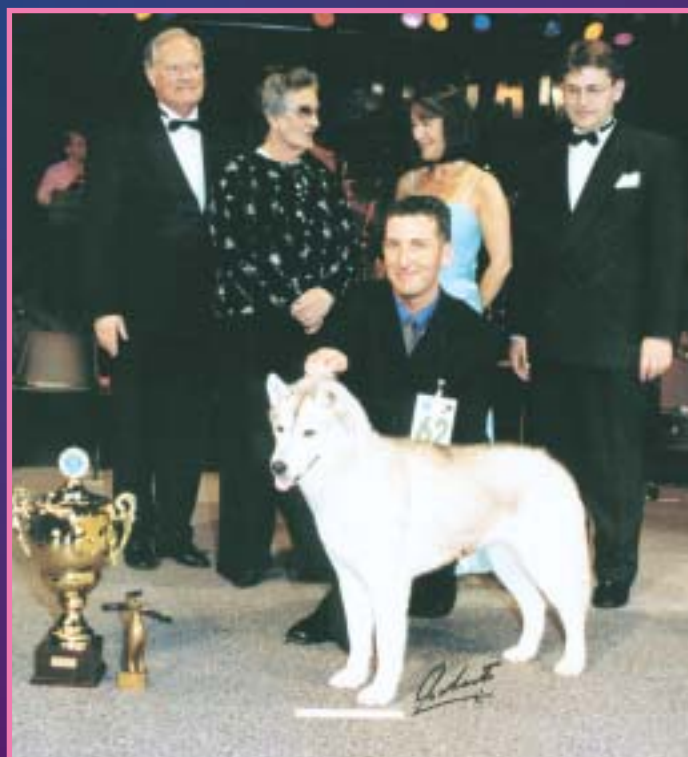
(above) St Gallen: 26 May 2002.

1462 entries Judge Best in Show: L Mach, Switzerland