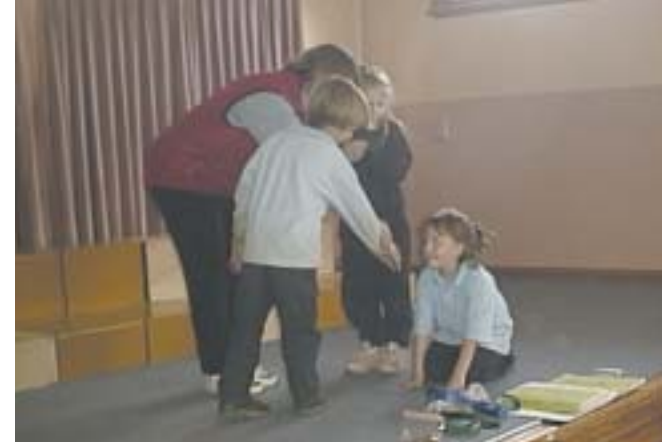
Role playing with preparatory age children on how to approach a dog