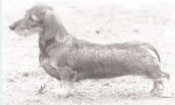
Ch Imlay Stephanite Star Bitch Challenge Sydney Royal 1981

FOR THE RECORD 40 Long Haired Champions (bred/and or owned) 3 Malaysian Champions 15 Miniature Wire Haired Champion 1 New Zealand Champion 1 Saluki 1 Whippet